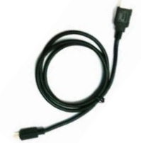
CABO USB EAX0066L05B