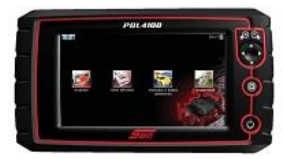
SCANNER AUTOMOTIVO PDL-4100