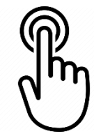
TESTE DE TOUCH